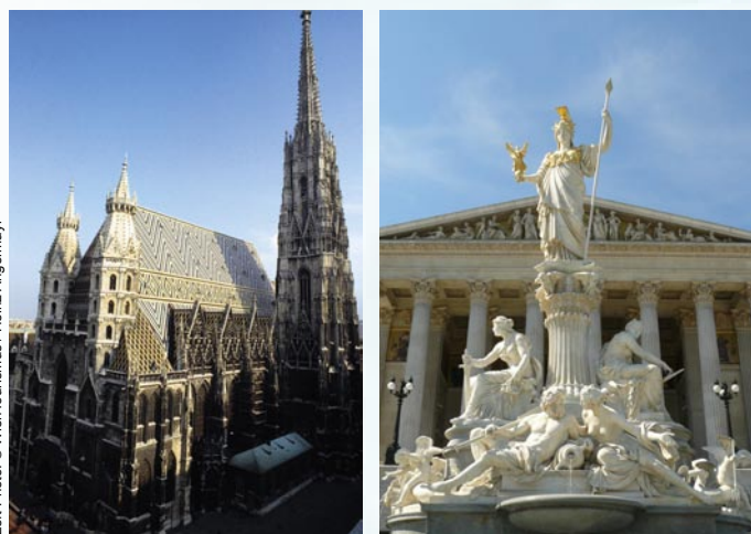
Left Photo: © Wien Tourismus / Heinz Angermayr

Evaluation cases should deal with policies, programmes or projects. Evaluations of products, individual companies or technologies are not in the focus of the EASY-ECO Vienna Conference 2008.